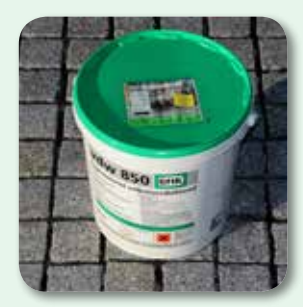
Clean the surface in order to remove all residues