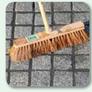
... and a damp coconut brush