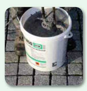
Mix thoroughly until homogeneous