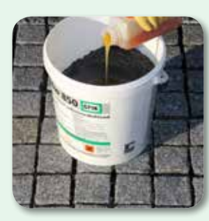
Add the binder component