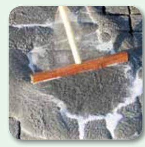
Work the mortar in