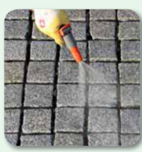
Wet the area