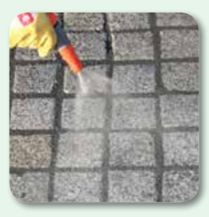
Clean with a hose spray ...