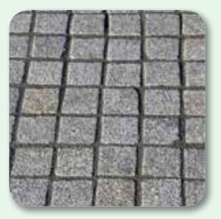
Observe directions for curing!